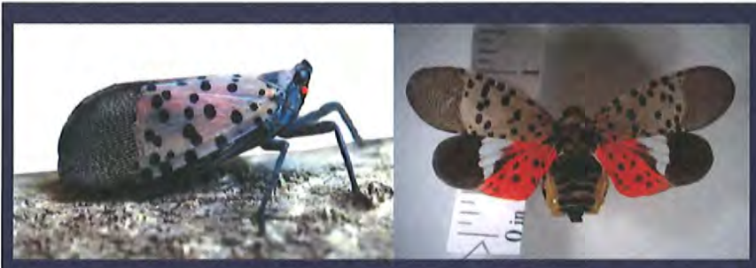
Adult Spotted Lanternfly, present in autumn months.

If you find any of these life stages of the Spotted Lanternfly, remove, devitalize, place in a sealed bag, and dispose of bag in the garbage.