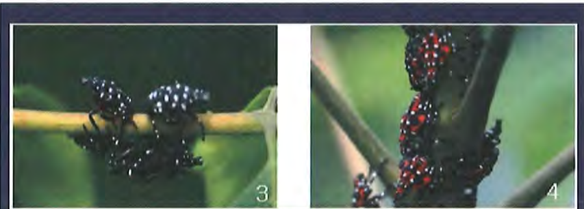
Spotted Lanternfly nymphs, present in spring and summer months. (Images from Park et al. 2009)

By signing this checklist, I am confirming that I have inspected my vehicle and those items I am moving from the Spotted Lanternfly quarantine area, and do not see any egg masses or insects in or on anything I am moving.