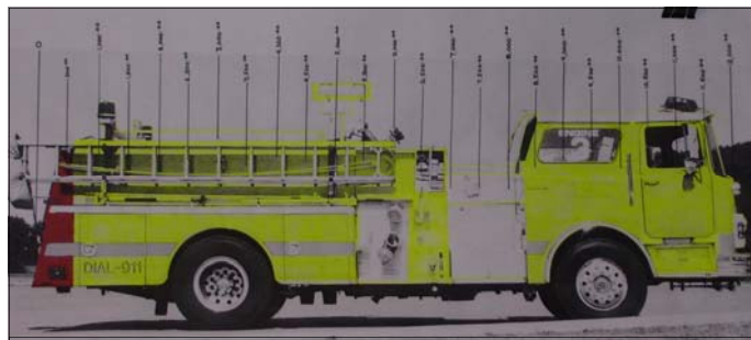
The thermometer so far

Before the closure in 2005, Upper Pottsgrove Township purchased a 1981 Mack Engine from North End Fire Company in Pottstown for UPTFC to use. It was refurbished in 2000, bringing it back to "new" status. The truck is serving the fire company well, holding 1100 feet of 5" hose and 500 gallons of water. Tailored to meet the needs of UPTFC, there is only one thing that is keeping the satisfaction of the fire company at bay - the color of the truck. It is still painted "North End Yellow," much to the membership's discontent. This is why they have started vigorous fundraising efforts to raise enough money to paint the truck red to match the rest of UPTFC's trucks. After receiving many estimates, ranging from $11,000 upwards to $16,000 to paint the truck, a fundraising committee is in the process of creating different fundraising events to help raise the necessary funding to paint the truck. The members have created a "thermometer" showing how much funding has been raised, and it accompanies the trucks when they make public appearances. Residents of the township are encouraged to help by contributing to the fundraising efforts of the UPTFC.