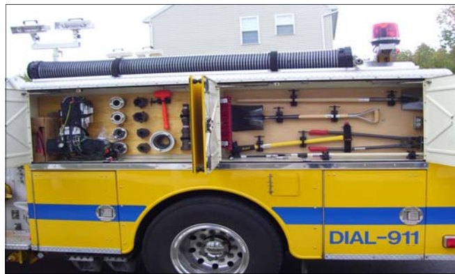
The modernized compartments with some of our new and necessary tools

The membership has been growing steadily, as new mem-