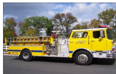
A shot of Engine 3... painted (for now) in "North End Yellow"

Growing each day with the perseverance and knowledge of its members, Upper Pottsgrove Twp. Fire Co. #1 has recovered and is better than ever! Each call that is dispatched, be it an automatic fire alarm, a vehicle accident, or a working fire, you'll see the members responding once again!