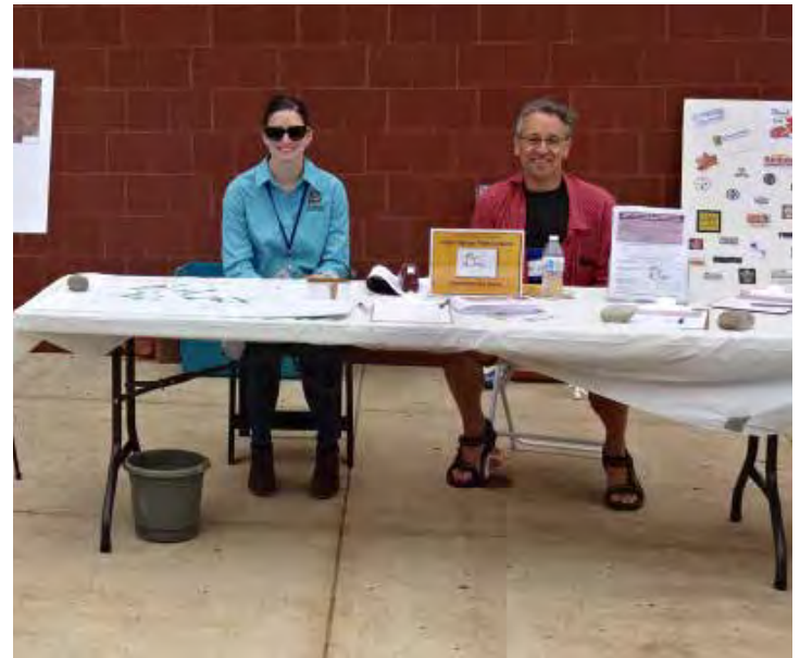
Public input opportunity at 2018 Upper Pottsgrove Community Day

The annual Montgomery Awards recognize the best in planning, design, and advocacy in Montgomery County, Pennsylvania.