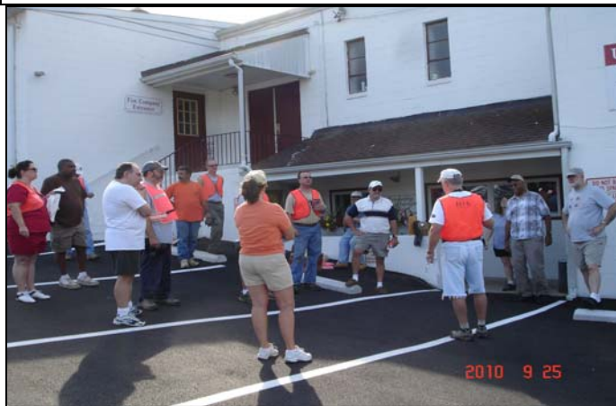
The Briefing for ICC

The Board of Commissioners thanks all residents that participated in the ICC on September 25. These residents joined thousands of volunteers along our east coast states making a difference in our communities and, more importantly, with the environment.